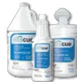
Rescue Disinfectant 193.69006.3 - 1 Gallon Concentrate 193.69005.3 - Ready to Use, 32 oz 193.69008.3 - 6x6.75" Wipes, 160 ct 193.69020.3 - 11x12" Wipes Bucket, 160 ct 193.62021.3 - 11x12" Wipes Bucket Refill, 160 ct