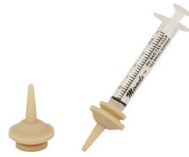
Original Miracle Nipple 875.00008.3 - 2 ct