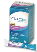
Synacore Digestive Support 712.70200.3 - Daily Supplement, 30 ct