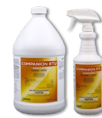
Companion RTU 193.60893.3 - 32 oz Spray Bottle 193.60892.3 - 1 Gallon ready to use