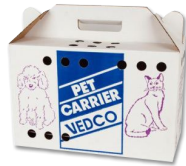
Pet Caddies 562.40404.3 - 9.25"x18.5"x12", 12 ct