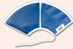
Free Flex Collar 000.03015.2 - 4" (10 cm) 000.03016.2 - 5.5" (14 cm)