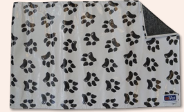
Pet Stability Mat - 36x22 000.20020.2 - White/Black Paw Print 000.20023.2 - Gray 000.20027.2 - Standard Blue