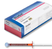
DiaGel Diarrhea Control 712.45020.3 - 0.5 ml Syringe, 6 ct