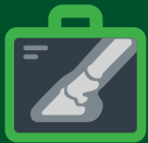
MOBILE VETERINARY X-RAY