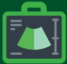
MOBILE EQUINE ULTRASOUND